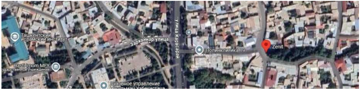
"Model tourist neighborhoods in Tashkent city (image 1)"

As examples of such historical mahallas, we can point to Qorasaroy street in Tashkent, the Chigatoy Gate area in the Olmazor street (image 2), and Olcha street located behind the Hazrati Imam complex on Zarqaynar street in Tashkent. These areas need to be improved by reconstructing the historical objects and designing both the surrounding new structures and the landscape design in a unified architectural style. Only then can we create a harmonious ensemble.